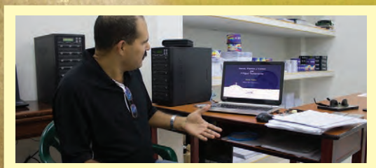
COPY CENTER FOR LOS PINOS

One of the first places they visited was Los Pinos Nuevos Seminary in Placetas. The group there had been going through our Spanish curriculum for the last three years and most of them had seen every lesson we had available in Spanish. At the seminary, their goal is to use all available resources to train indigenous leaders who will then teach and train other church leaders. Because Cubans rarely leave the city where they were born, distributing Third Millennium's curriculum is the most effective way they can get seminary education to the pastors in the rural parts of the country.