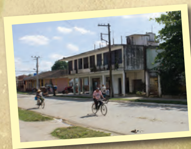
SANTA CLARA CHURCH

The meeting with the group in Santa Clara was one of their most encouraging meetings. Everyone was speaking simultaneously about how much Third Mill meant to them. One man in his mid-70s said, "I would never have dreamed I could have gotten this kind of education at my age. And I don't have to go anywhere. I have a Ph.D. in my living room, teaching me about God's Word, and not just any Ph.D. They are the best Ph.D.'s in their field."